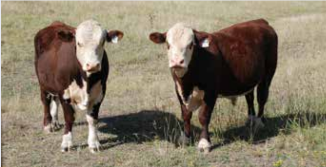
4 young bulls paddock reared for sale.