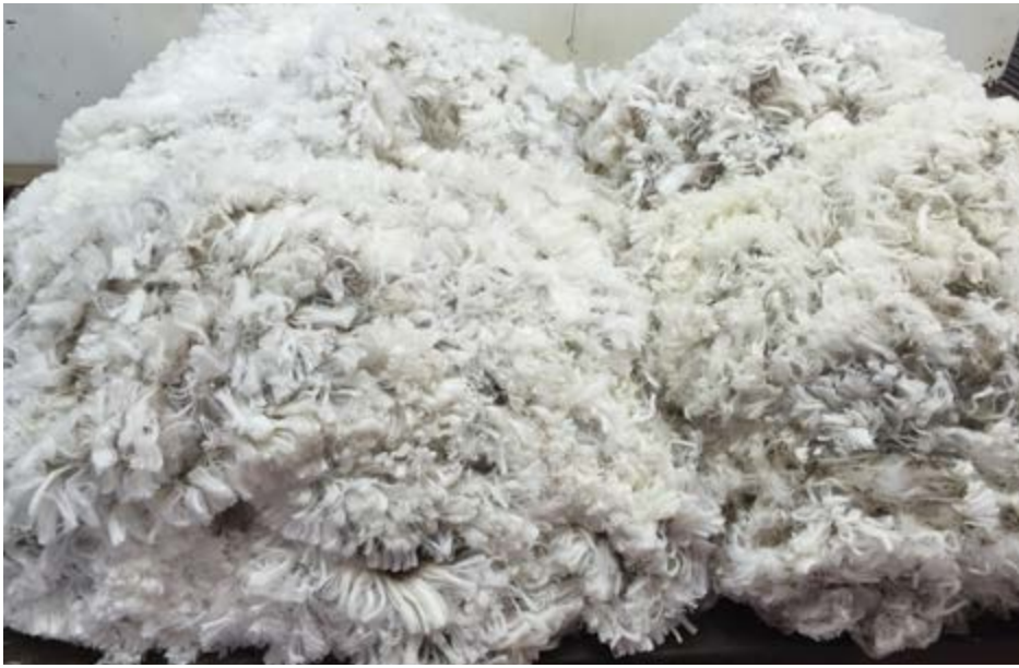
The fleeces from the four rams purchased by Samka Pty Ltd at our annual ram sale, including the top priced Lot 1 ram

Euralie purchased the top price ram, Lot 1, for $3,600, as well as Lots 2, 5 and 24 at this year's Merrignee Annual Ram Sale. These young rams were shorn on 27 November 2015 (32 weeks fleeces) and the four fleeces averaged 6kgs (6kgs, 6.2kgs, 5.9kgs and 6.1kgs respectively).