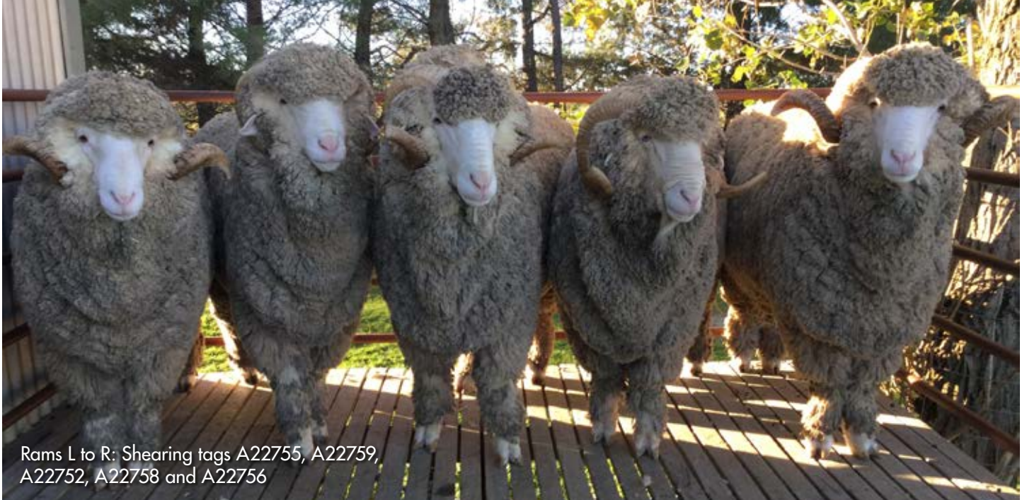
Rams L to R: Shearing tags A22755, A22759, A22752, A22758 and A22756