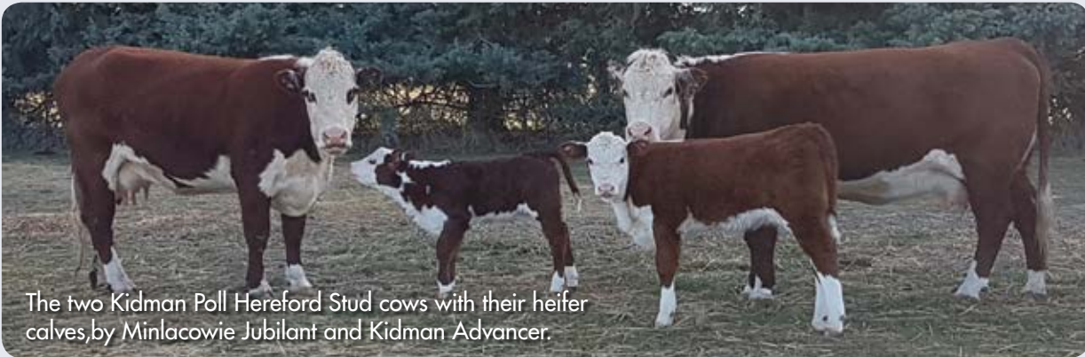
The two Kidman Poll Hereford Stud cows with their heifer calves, by Minlacowie Jubilant and Kidman Advancer.

Two year old Merrignee Bulls are still available for sale